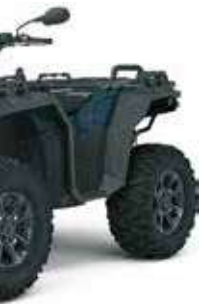
XP 1000 S LIMITED EDITION