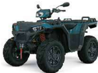
SPORTSMAN XP 1000