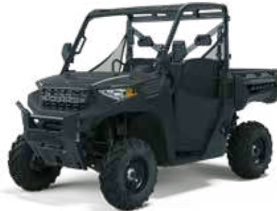
RANGER 1000 TRIM: EPS / / EPS NORDIC PRO SE /