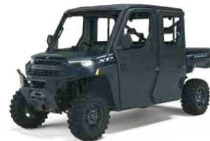
DIESEL / DELUXE /