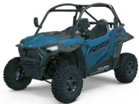
RZR® TRAIL S