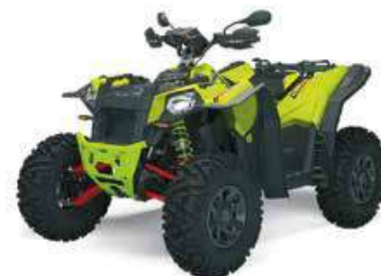
SCRAMBLER XP 1000 S