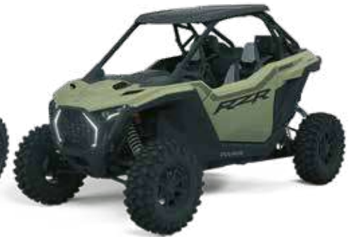
RZR® PRO XP