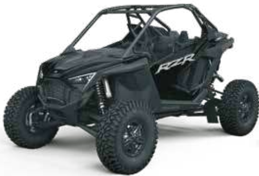
RZR® PRO S