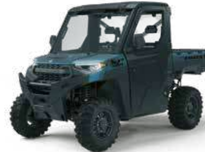
RANGER XP 1000 TRIM: EPS / EPS ABS / / EPS HUNTER EDITION / / EPS NORDIC PRO SE /