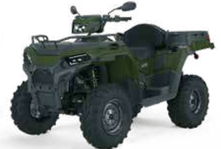
SPORTSMAN X2 570 EPS TRIM: EPS / EPS LE EPS NORDIC PRO