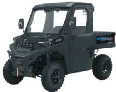
RANGER SP 570 TRIM: SP 570 / SP 570 EPS / / SP 570 EPS HUNTER EDITION / / SP 570 EPS NORDIC PRO /