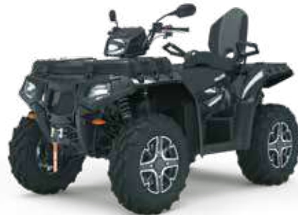
SPORTSMAN TOURING XP 1000