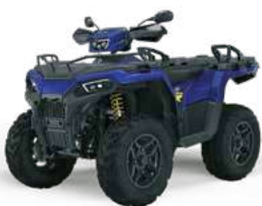
SPORTSMAN 570 TRIM: EPS / AGRI PRO BLACK EDITION / SP PREMIUM LE / ÖHLINS HUNTER EDITION