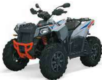
SCRAMBLER XP 1000