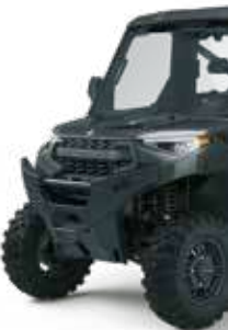
RANGER TRIM: BASE