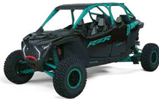
RZR® PRO R 4