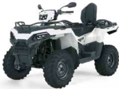
SPORTSMAN TOURING 570 TRIM: EPS / EPS SP