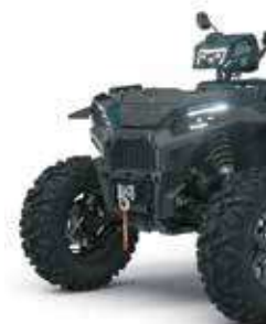
SPORTSMAN TRIM: EPS / LIM