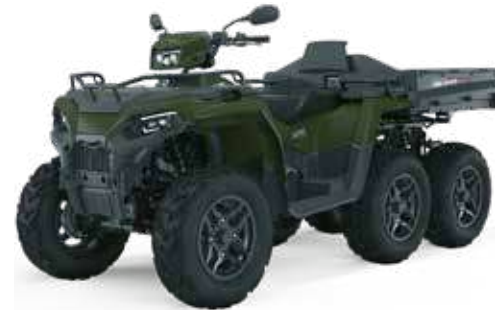
SPORTSMAN 6X6 570 TRIM: EPS / EPS NORDIC PRO