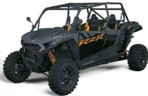
RZR® XP 4