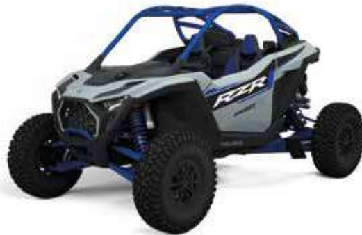
RZR® PRO R